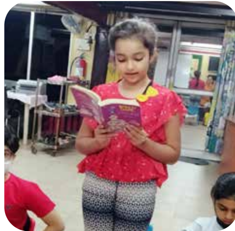
Read Aloud Sessions